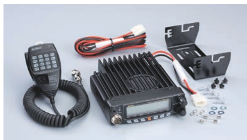
Shown with standard accessories

Standard accessories declared herein are our factory default and may vary at moment of sales depending on the market and Dealers' sales policy.